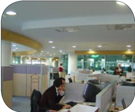
Algida Unilever, Turkey

We offer many well-documented reference projects: