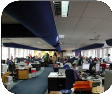
Royal Bank of Scotland, UK