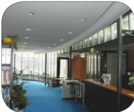
St. Herzogenbusch, the Netherlands