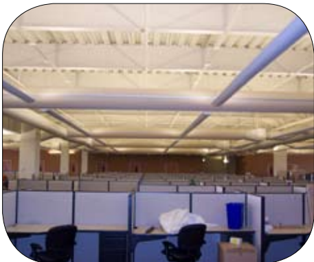
Dell Technical Support Centre, USA