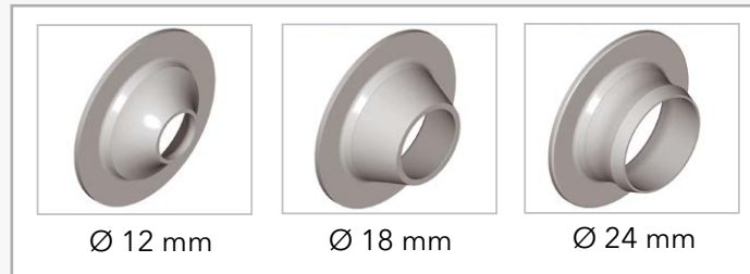
Ø 12 mm