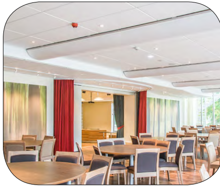
Aronsborg Baalsta, Sweden