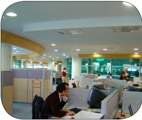
Algida Unilever, Turkey

We offer many well-documented reference projects: