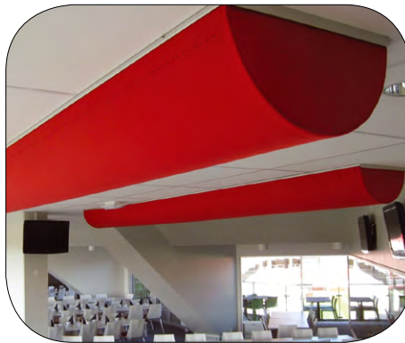
Guldfaageln Arena, Sweden