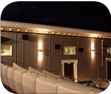
Frogner Cinema, Norway