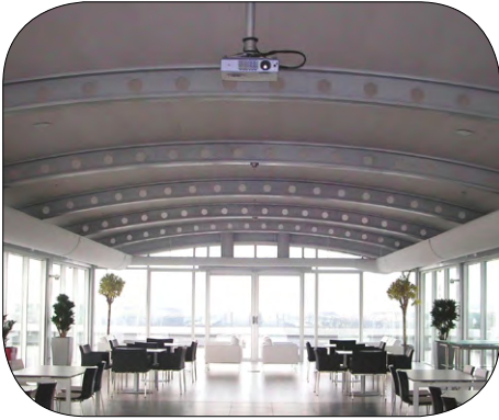
Bank Asya, Turkey

We offer many well-documented reference projects: