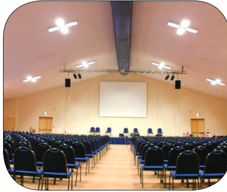
Yeovil Community Church, UK