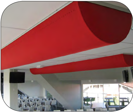
Guldfaageln Arena, Sweden