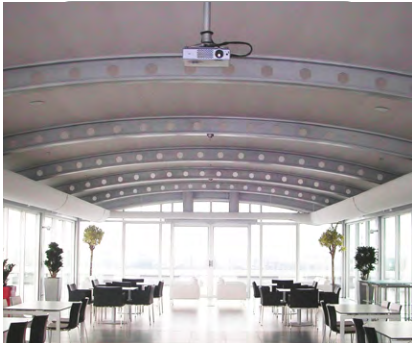
Vakif Participation Bank, Turkey

We offer many well-documented reference projects: