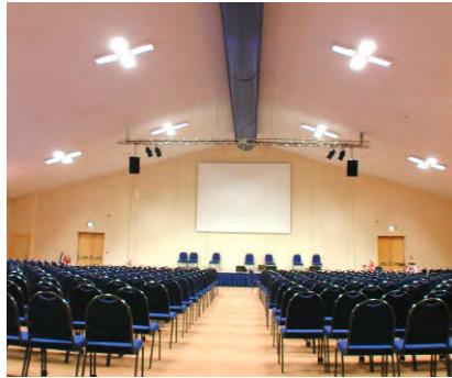
Yeovil Community Church, England