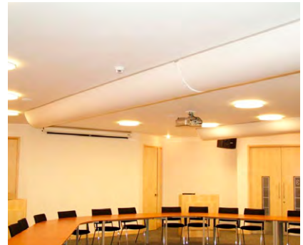
Grace Conference, England