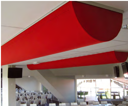
Guldfaageln Arena, Sweden