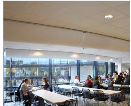
Lysaker Torg, Norway