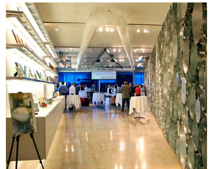
RB Akins, USA

For documentation and more references, please read more at www.kefibertec.com