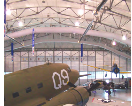
Dover Air Base, USA