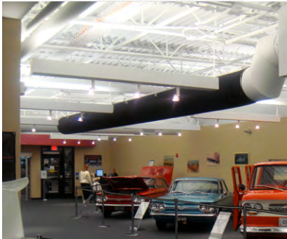
The National Corvette Museum, USA

We offer many well-documented reference projects: