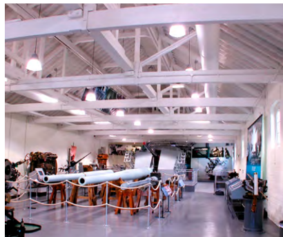
Priddy's Hard Museum, England