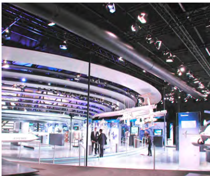
Farnborough Exhibition, England