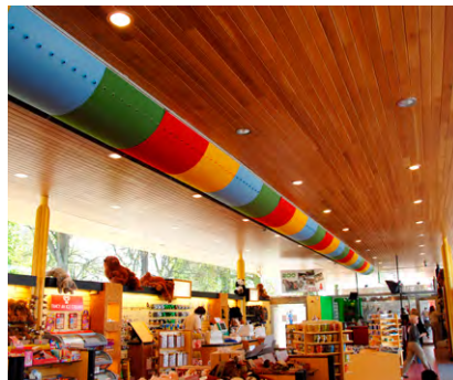
Dublin Zoo, Ireland