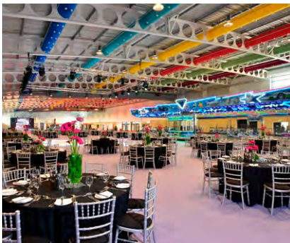
Yorkshire Event Centre, England