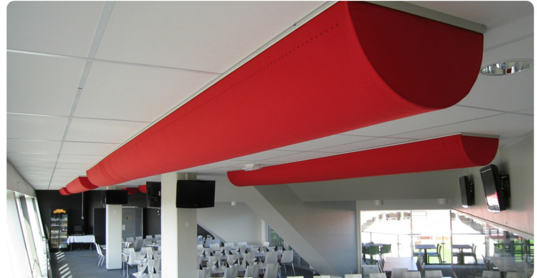
Halfround (D shaped) textile ducts

The Guldfågeln staff is also satisfied with the ventilation system. Even during a football game with several hundred people in the room the air will still be nice and cool.