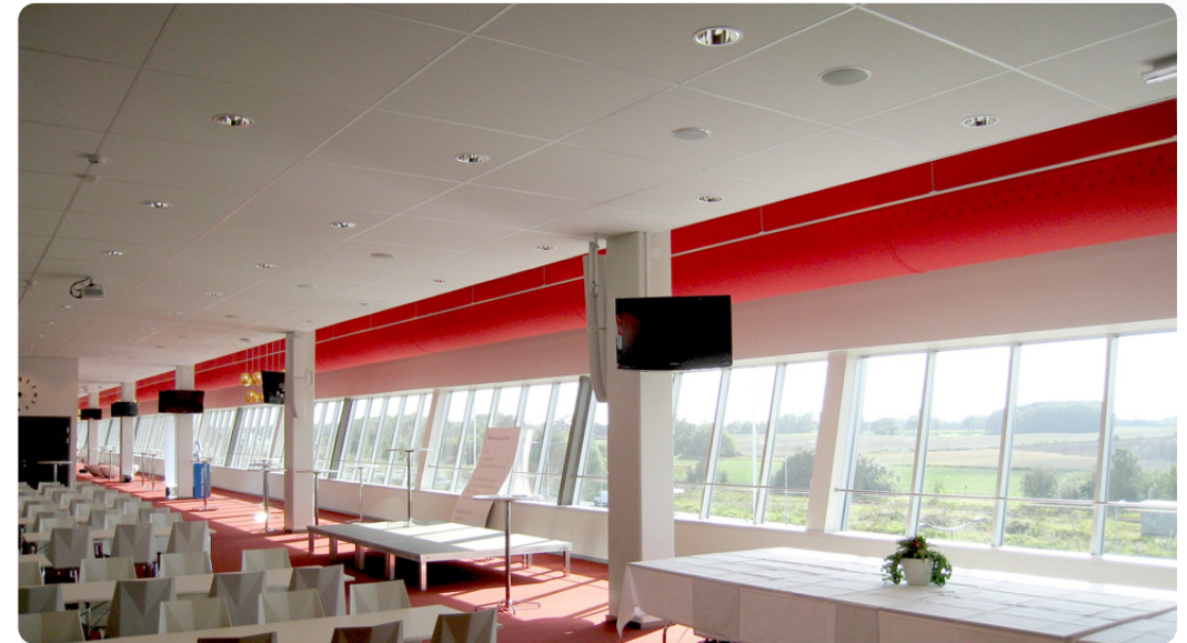
85 metres Ø1000 duct