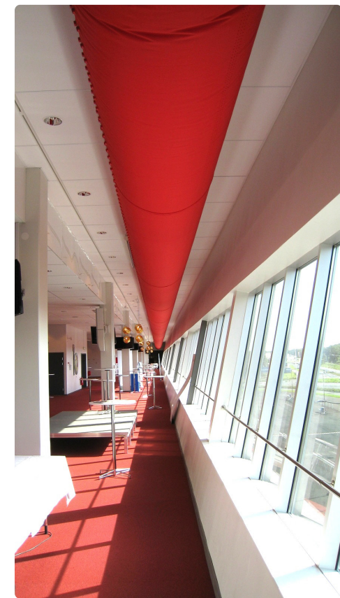
Textile ducts with nozzles and laser cut holes

The stadium was recently built and in that connection a ventilation system was installed.