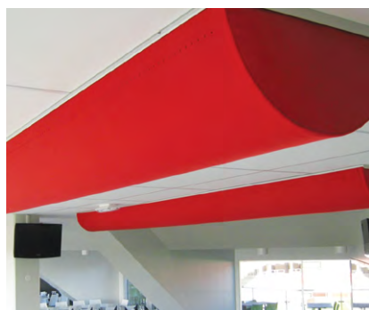
Guldfaageln Arena, Sweden