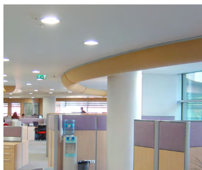
Algida Unilever, Turkey