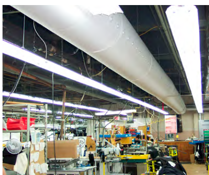
Hickey Freeman, USA