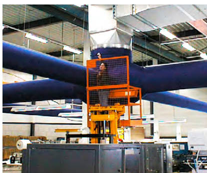
Drukkerij Geostick, the Netherlands

We offer many well-documented reference projects: