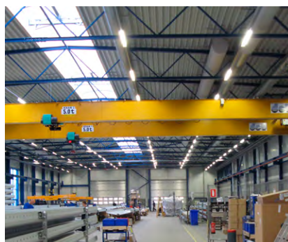
IAI Towers, Denmark