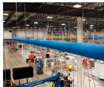
Daikin Texas Technology Park, USA

For documentation and more references, please read more at www.ke-fibertec.com