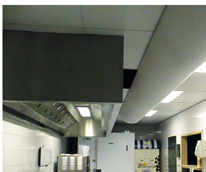
Skibaan, the Netherlands