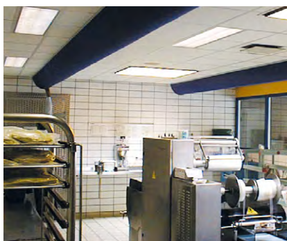
Noorderhaven, the Netherlands

We offer many well-documented reference projects: