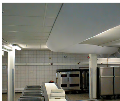
Keuken Ruyschenbert, the Netherlands