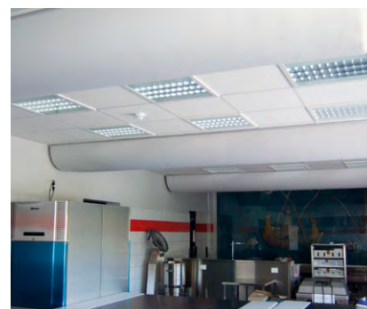
Etterstad Cooking School, Norway

For documentation and more references, please read more at www.ke-fibertec.com