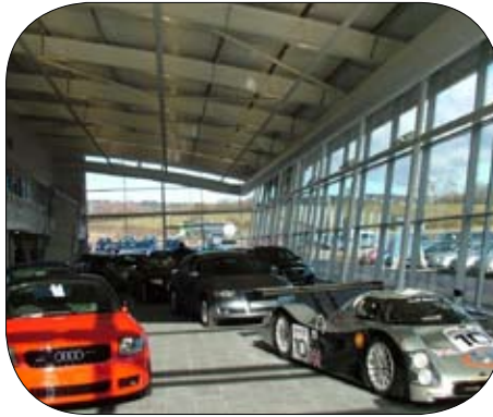
Audi Cardiff, Wales