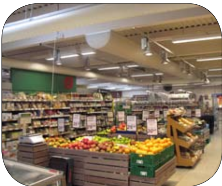
Superbrugsen, Skaevinge, Denmark