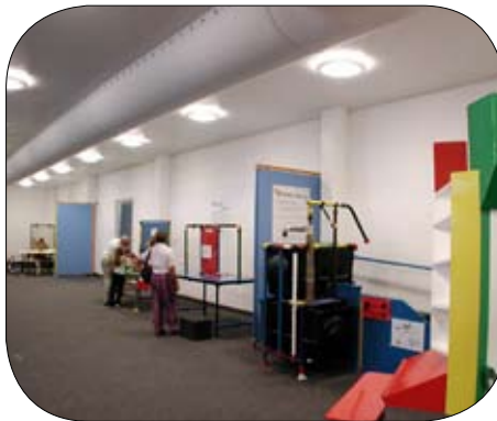
Intech Exhibition, UK