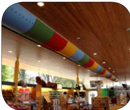
Dublin Zoo, Ireland