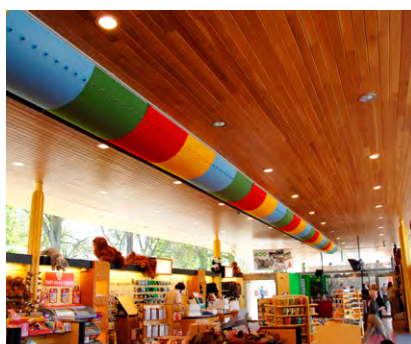
Dublin Zoo, Ireland