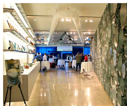
RB Akins, USA

For documentation and more references, please read more at www.ke-fibertec.com