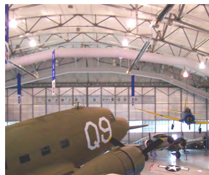
Dover Air Base, USA