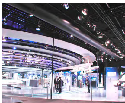
Farnborough Exhibition, England