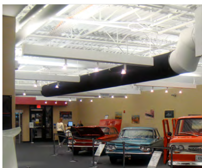
The National Corvette Museum, USA

We offer many well-documented reference projects: