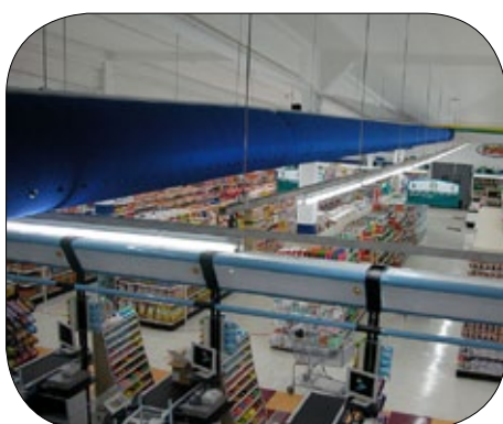
Supermarket, Netherlands Antilles