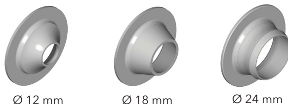
Ø 12 mm