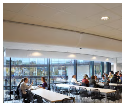
Lysaker Torg, Norway