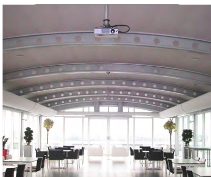
Vakif Participation Bank, Turkey

We offer many well-documented reference projects: