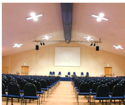
Yeovil Community Church, England