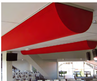
Guldfaageln Arena, Sweden