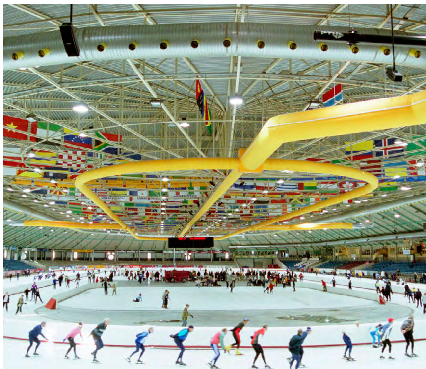
Thialf Heerenveen, the Netherlands