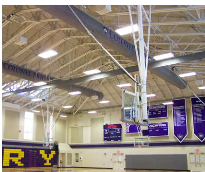
Curry College, USA