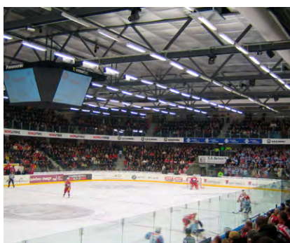
Gigantium Ice Arena, Denmark