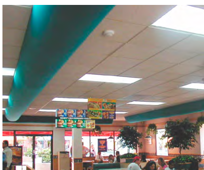
Wendy's, The Netherlands