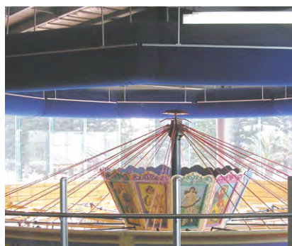
Holdfast Shores, Australia