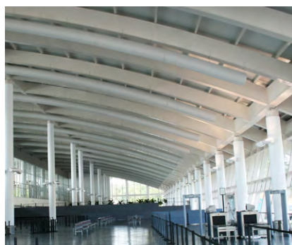
Cruise terminal, Santo Domingo